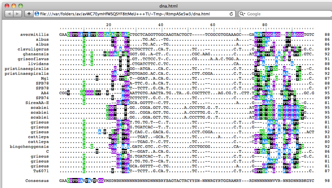
Figure 2: Amplicon with the target site for each primer colored

avermitilis ), and each primer's target site is colored. We can highlight the target sequence so that only mismatches are colored in the non-target sequences. It is clear why this target site was chosen, because all other Streptomyces species have multiple mismatches to both the forward and reverse primers. The non-target mismatches, especially those located nearest the 3' end (towards the center of the amplicon), will act to lower both hybridization and elongation efficiency of non-target amplification.