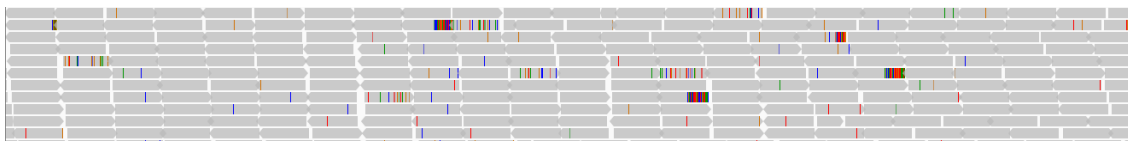
Figure 3: Simulated reads mapped in proper pair Mismatches and soft-clips are shown as colored vertical lines in reads.